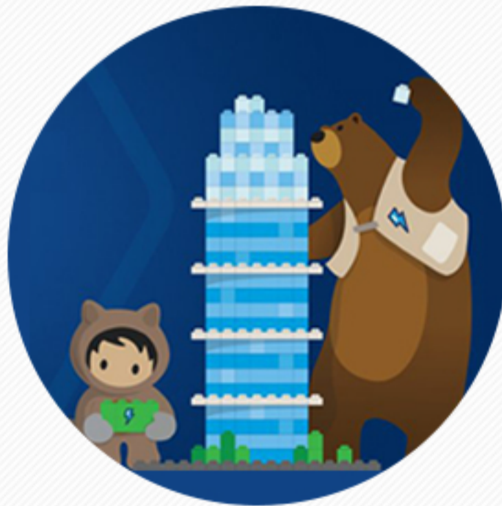
Salesforce lightning components