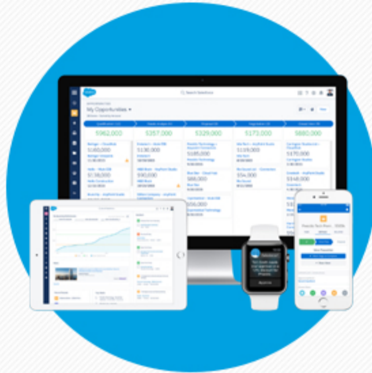
Salesforce lightning experience

We deployed the following technologies to suit the requirement of RCA: